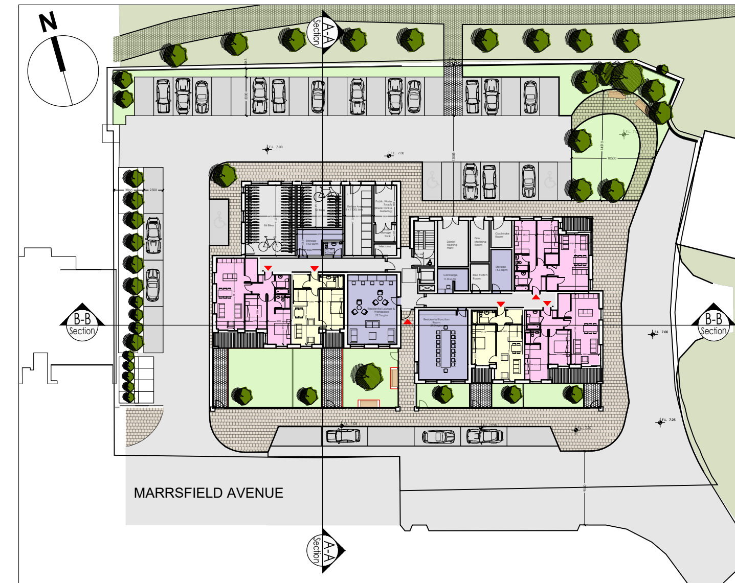
KEY PLAN Scale 1:500