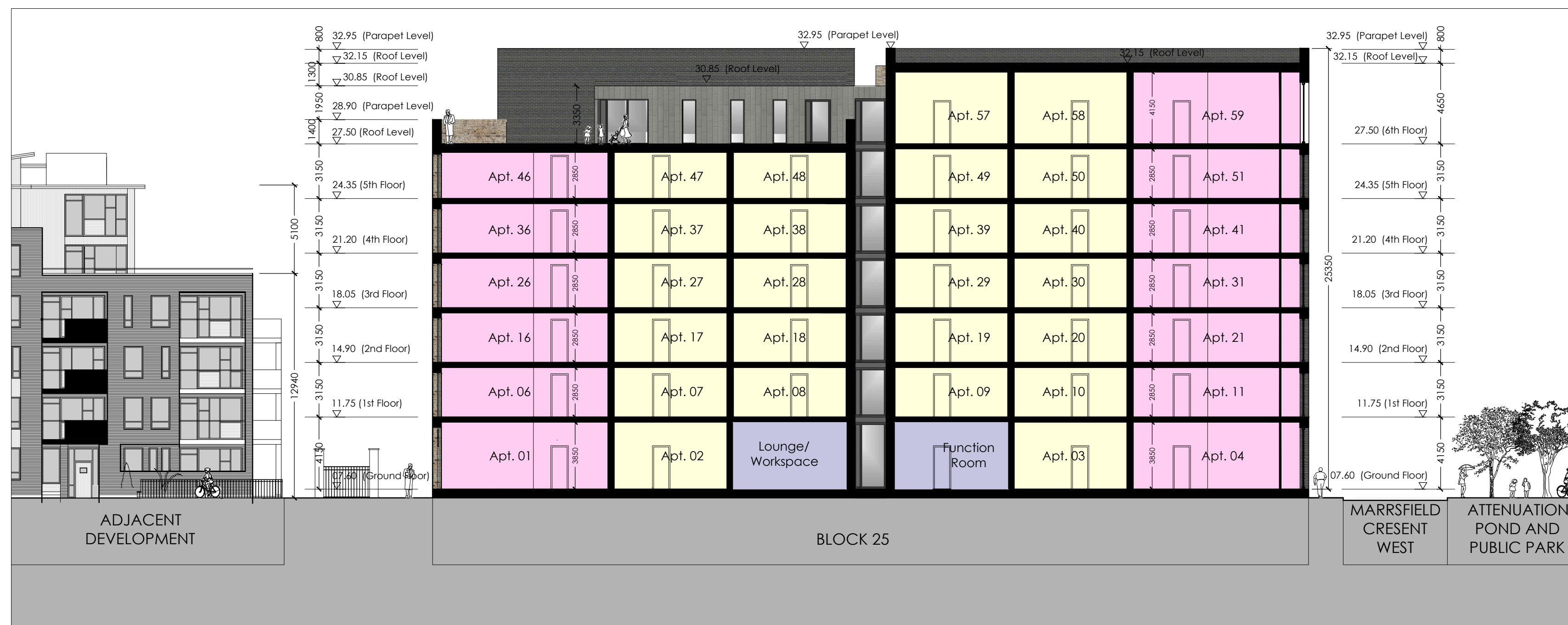
SECTION BB Scale 1:200